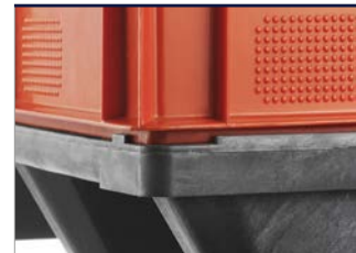
Optional without safety rim