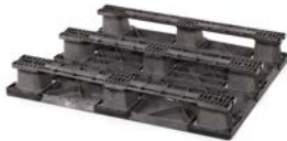
> 3 runners (3R)