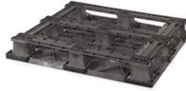
> 5 runners (5R)