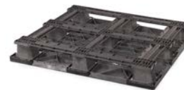
> 6 runners (6R)