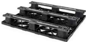
> 3 runners (3R)