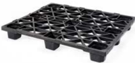
> open deck (OD)