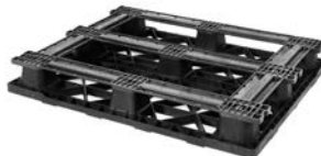
> 5 runners (5R)