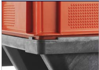
Optional without safety rim