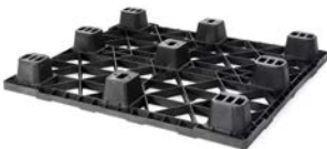
> 9 feet (9F)