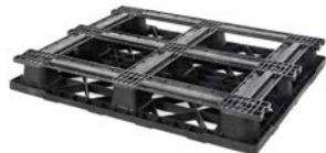
> 6 runners (6R)