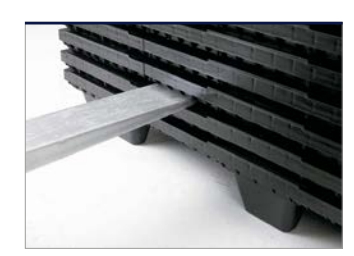
Interspace provided facilitates unstacking by fork-lift truck.