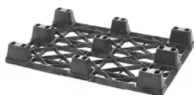
> 9 feet (9F)