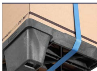
Bevelled edges on all four sides