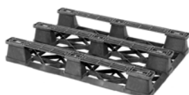
> 3 runners (3R)