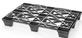
> open deck (OD)