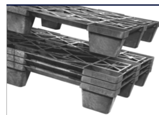
Nestable plastic pallets require less floor space.