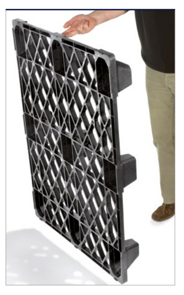
Due to its very low weight, the plastic pallet is easy to handle.