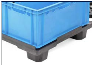
... or extra high 25 mm safety rim.