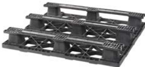
> 3 runners (3R)