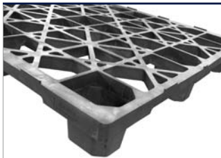
As option: 5 mm ...