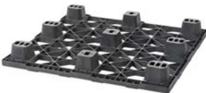
> 9 feet (9F)