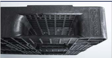
Bevelled base runners enhance pallet truck compatibility.