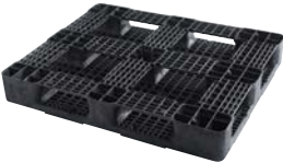
> 6 runners (6R)