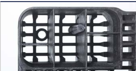
Flow-through design. Easy to clean.