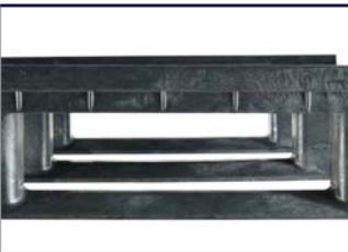
Curved sloping ramps up and down the internal blocks.