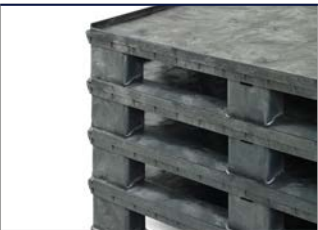
Safety rim ensures easy transportation of empty pallet stacks.