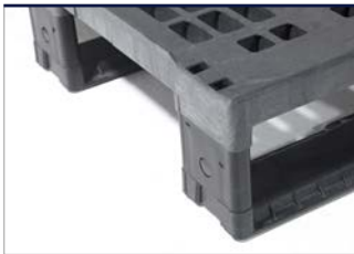
3 parts pallet with connector system