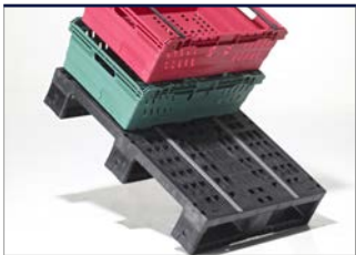
anti-slip strips (optional)