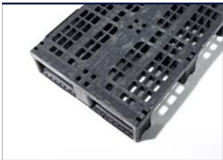
No. 1 in retail