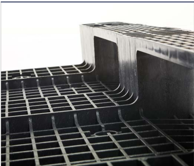
Different height profiles lend the pallet optimal flexural strength.